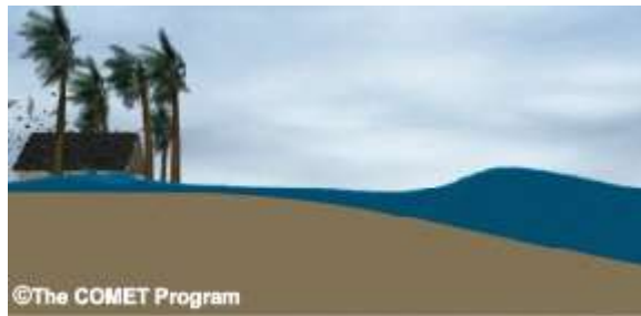
Surge animation with shallow continental shelf