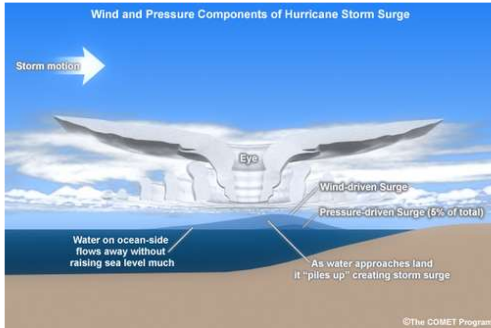
Wind and Pressure Components of Hurricane Storm Surge

The maximum potential storm surge for a particular location depends on a number of different factors. Storm surge is a very complex phenomenon because it is sensitive to the slightest changes in storm intensity, forward speed, size (radius of maximum winds-RMW), angle of approach to the coast, central pressure (minimal contribution in comparison to the wind), and the shape and characteristics of coastal features such as bays and estuaries.