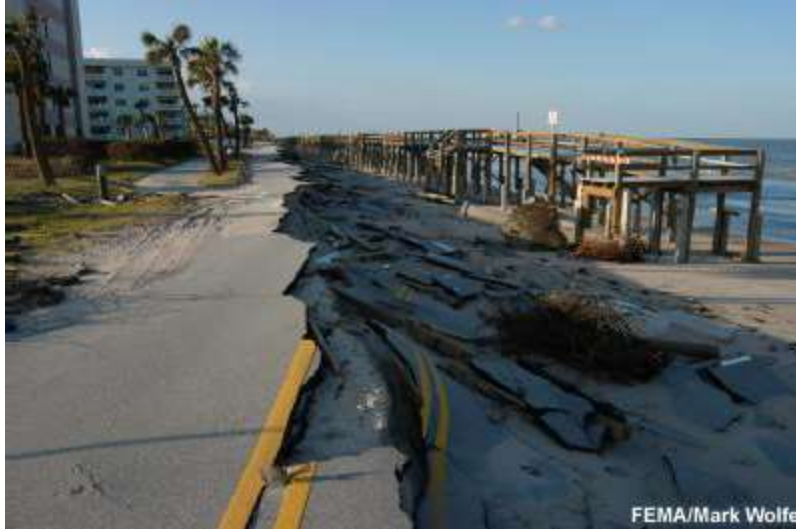
Beachfront road and boardwalk damaged by Hurricane Jeanne (2004)

In confined harbors, the combination of storm tides, waves, and currents can also severely damage marinas and boats. In estuaries and bayous, salt water intrusion endangers the public health, kills vegetation, and can send animals, such as snakes and alligators, fleeing from flooded areas.