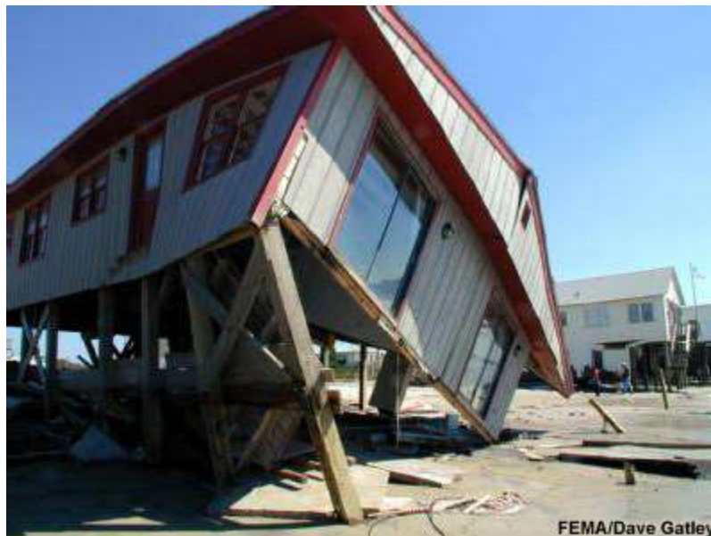
Although elevated, this house in North Carolina could not withstand the 15 ft (4.5 m) of storm surge that came with Hurricane Floyd (1999)

Adding to the destructive power of surge, battering waves may increase damage to buildings directly along the coast. Water weighs approximately 1,700 pounds per cubic yard; extended pounding by frequent waves can demolish any structure not specifically designed to withstand such forces. The two elements work together to increase the impact on land because the surge makes it possible for waves to extend inland.