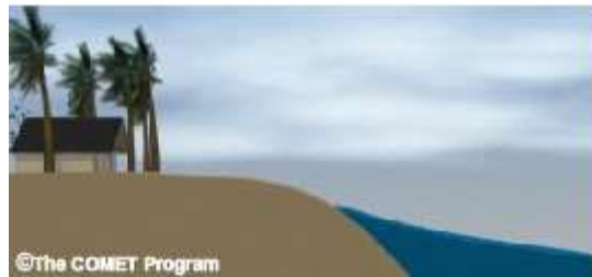
Surge animation with steep continental shelf (Click on Image to Play Video)

Adding to the destructive power of surge, battering waves may increase damage to buildings directly along the coast. Water weighs approximately 1,700 pounds per cubic yard; extended pounding by frequent waves can demolish any structure not specifically designed to withstand such forces. The two elements work together to increase the impact on land because the surge makes it possible for waves to extend inland.