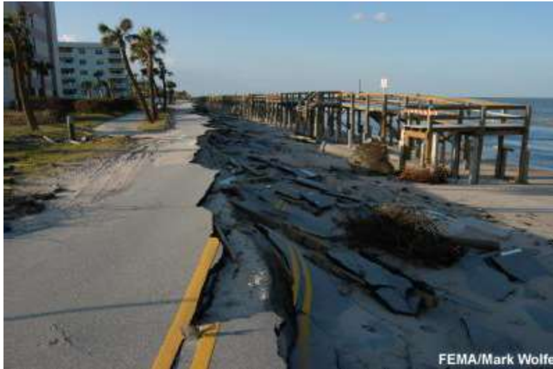
Beachfront road and boardwalk damaged by Hurricane Jeanne (2004)

In confined harbors, the combination of storm tides, waves, and currents can also severely damage marinas and boats. In estuaries and bayous, salt water intrusion endangers the public health, kills vegetation, and can send animals, such as snakes and alligators, fleeing from flooded areas.