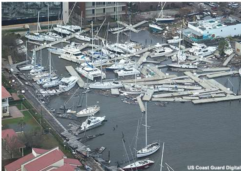
Damaged boats in a marina

In confined harbors, the combination of storm tides, waves, and currents can also severely damage marinas and boats. In estuaries and bayous, salt water intrusion endangers the public health, kills vegetation, and can send animals, such as snakes and alligators, fleeing from flooded areas.