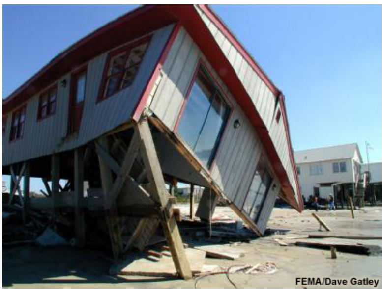
Although elevated, this house in North Carolina could not withstand the 15 ft (4.5 m) of storm surge that came with Hurricane Floyd (1999)

Adding to the destructive power of surge, battering waves may increase damage to buildings directly along the coast. Water weighs approximately 1,700 pounds per cubic yard; extended pounding by frequent waves can demolish any structure not specifically designed to withstand such forces. The two elements work together to increase the impact on land because the surge makes it possible for waves to extend inland.