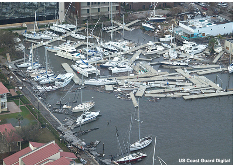
Damaged boats in a marina

In confined harbors, the combination of storm tides, waves, and currents can also severely damage marinas and boats. In estuaries and bayous, salt water intrusion endangers the public health, kills vegetation, and can send animals, such as snakes and alligators, fleeing from flooded areas.