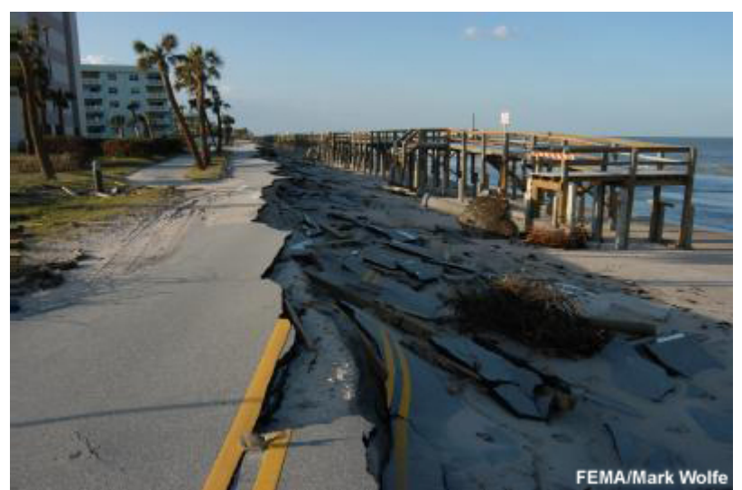
Beachfront road and boardwalk damaged by Hurricane Jeanne (2004)

In confined harbors, the combination of storm tides, waves, and currents can also severely damage marinas and boats. In estuaries and bayous, salt water intrusion endangers the public health, kills vegetation, and can send animals, such as snakes and alligators, fleeing from flooded areas.