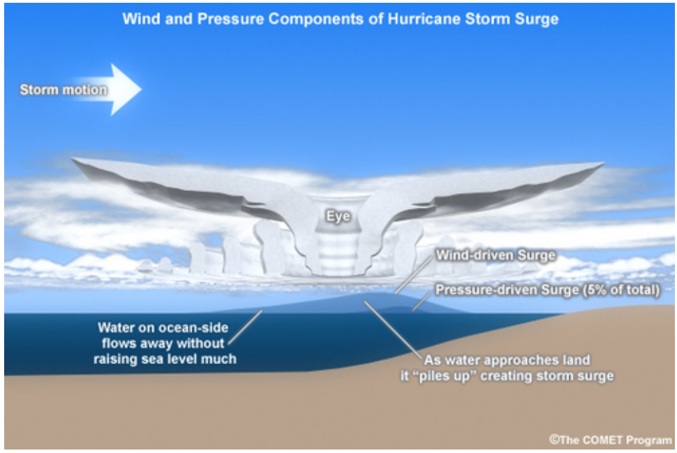
Wind and Pressure Components of Hurricane Storm Surge

The maximum potential storm surge for a particular location depends on a number of different factors. Storm surge is a very complex phenomenon because it is sensitive to the slightest changes in storm intensity, forward speed, size (radius of maximum winds-RMW), angle of approach to the coast, central pressure (minimal contribution in comparison to the wind), and the shape and characteristics of coastal features such as bays and estuaries.